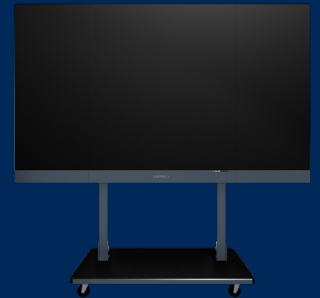
Instant signage or messaging anywhere