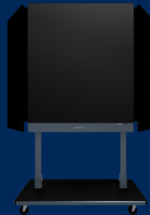
Cover all angles